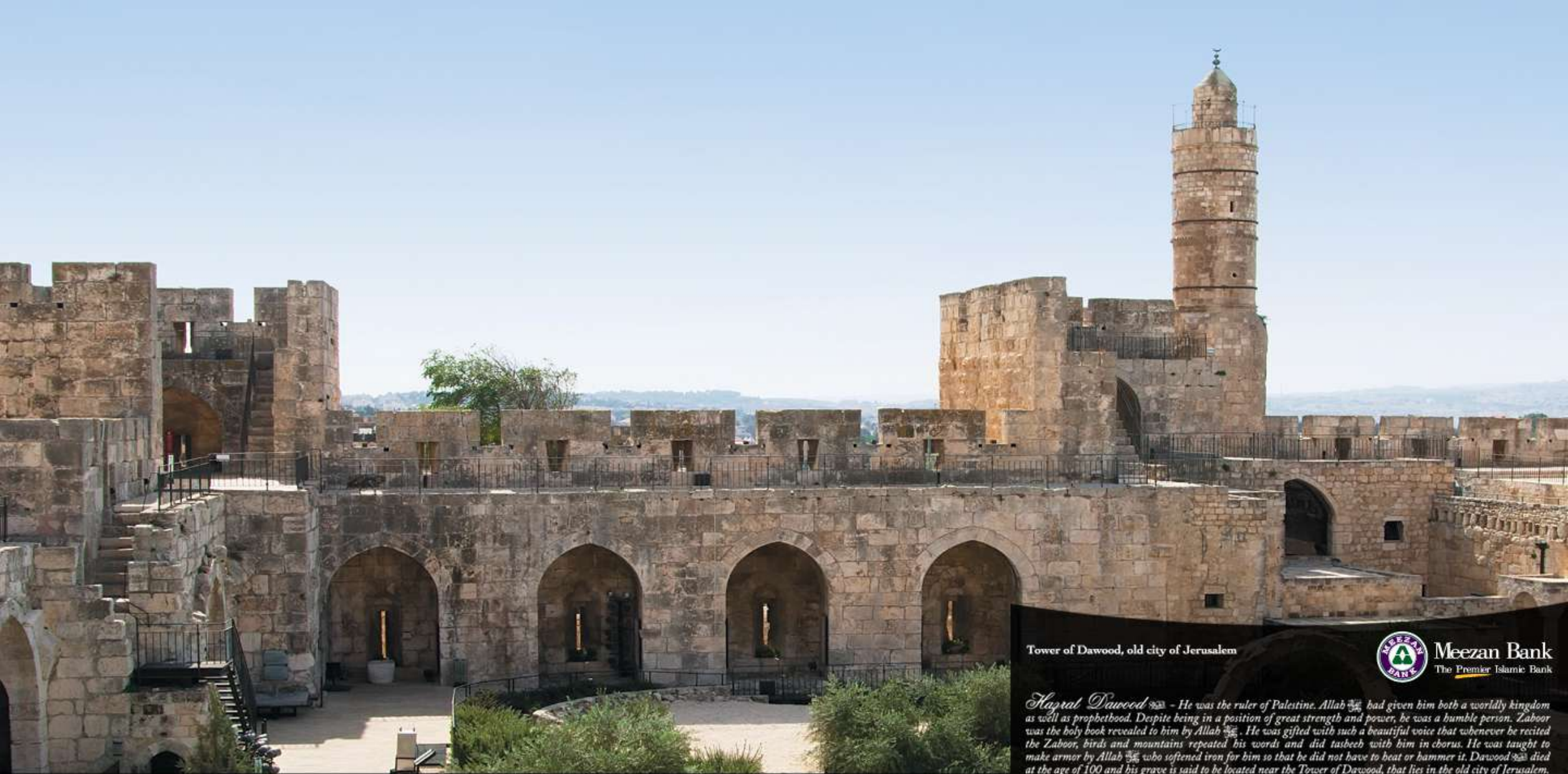
Tower of Dawood, old city of Jerusalem