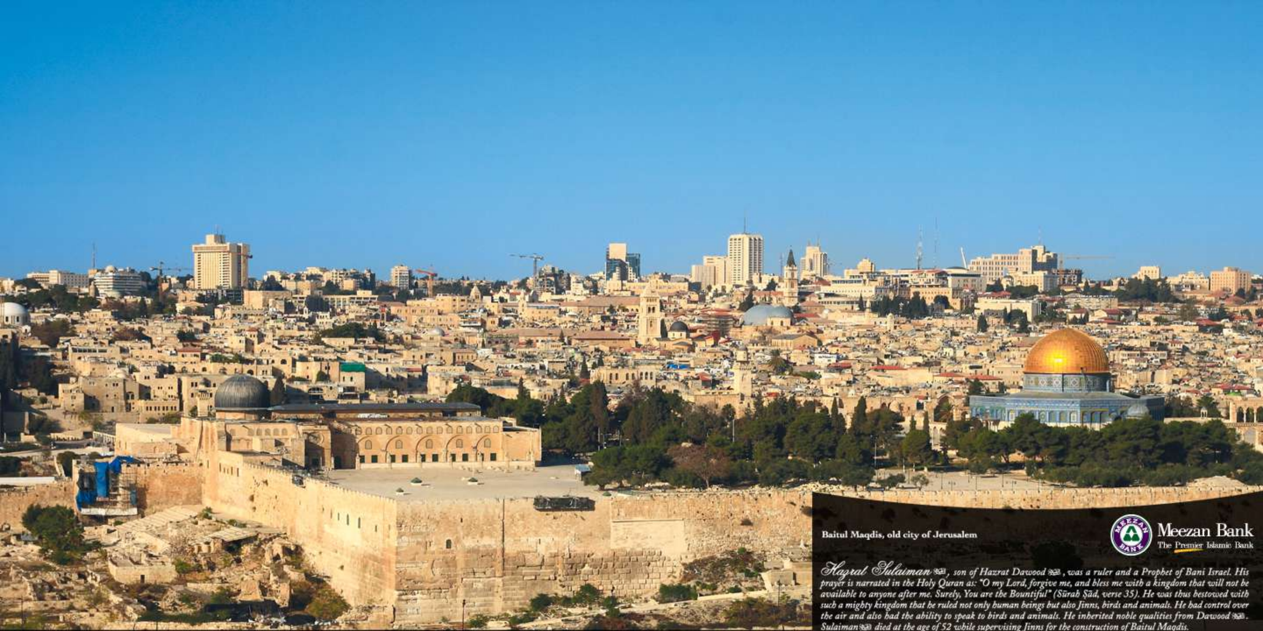
Baitul Maqdis, old city of Jerusalem