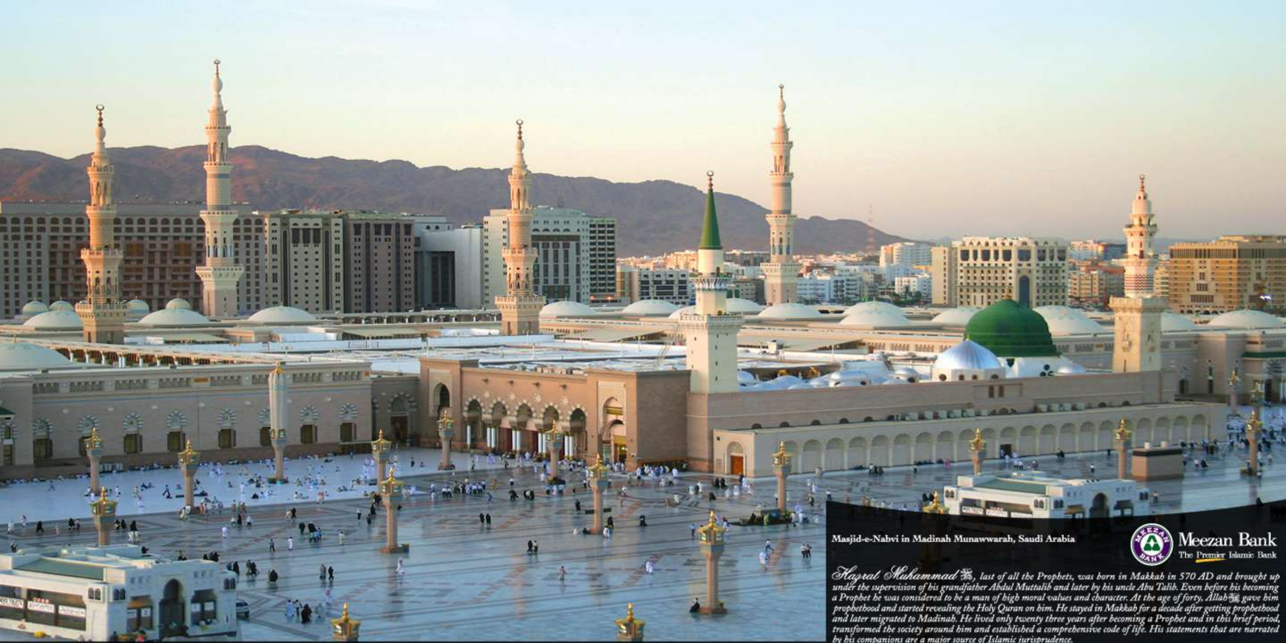
Masjid-e-Nabvi in Madinah Munawwarah, Saudi Arabia