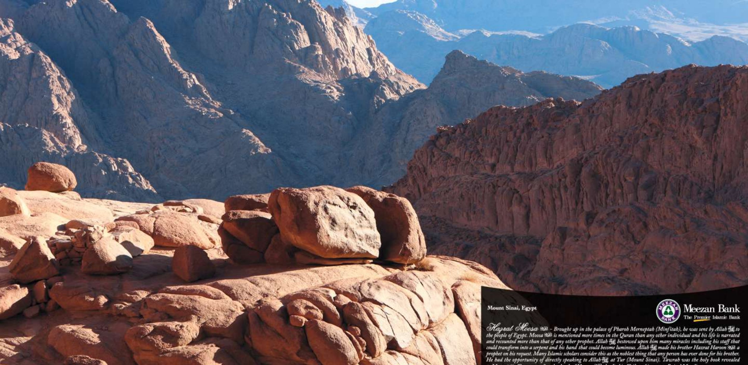
Mount Sinai, Egypt