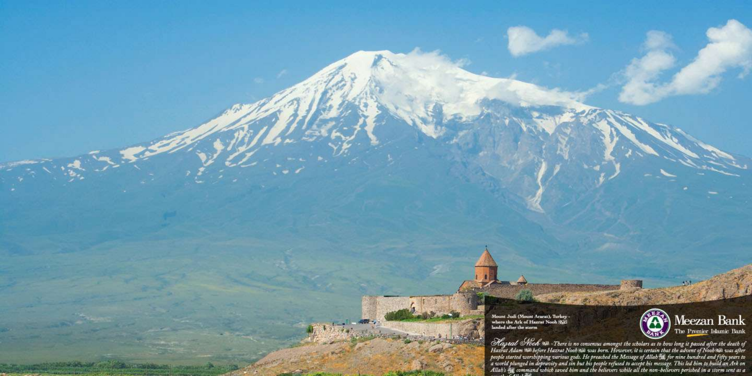
Mount Judi (Mount Ararat), Turkey - where the Ark of Hazrat Nooh عليه السلام landed after the storm