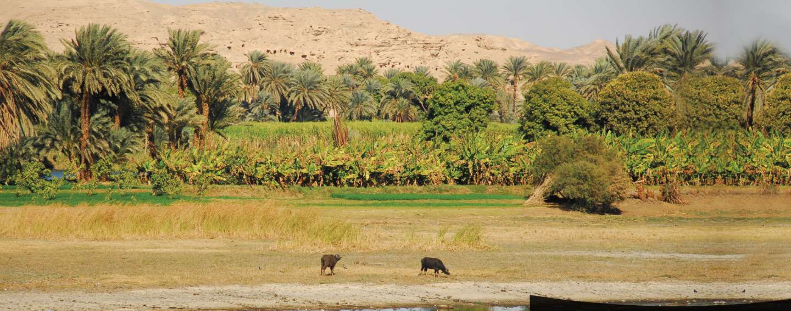
The Nile River, Egypt.