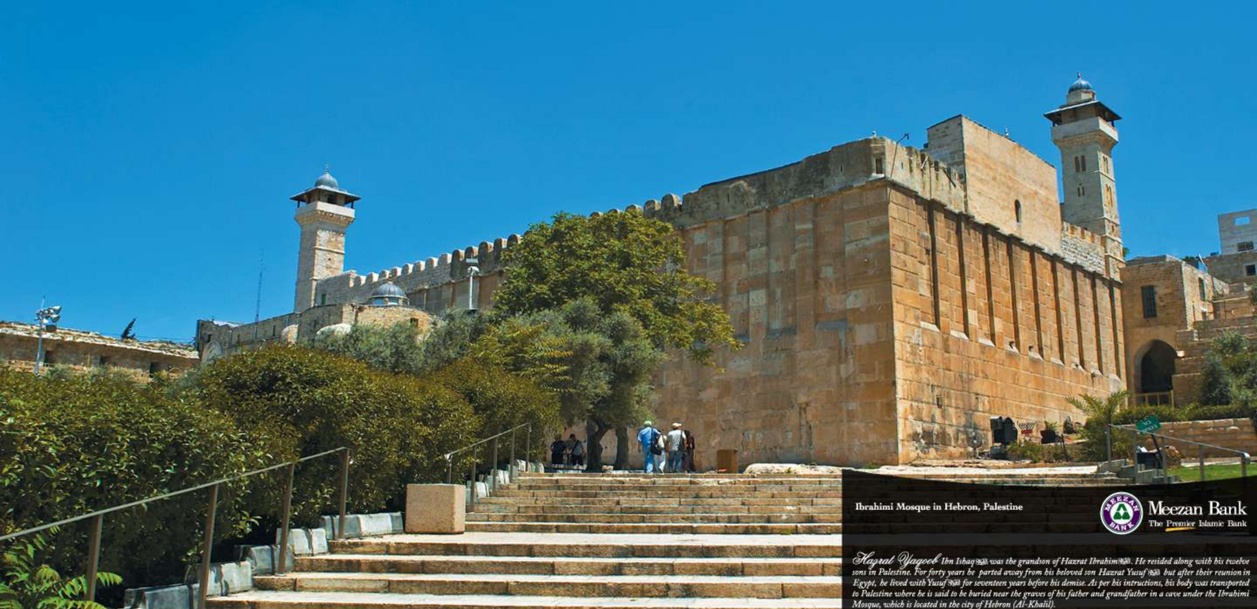
Ibrahimi Mosque in Hebron, Palestine